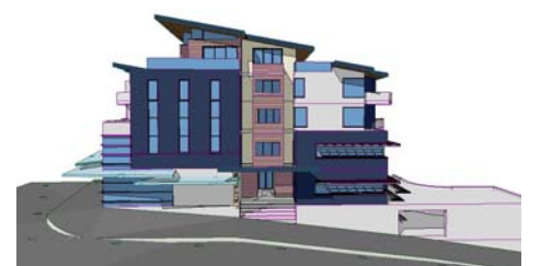
Mixed Use Development-Wollongong