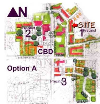
Gerringong CBD - Infill