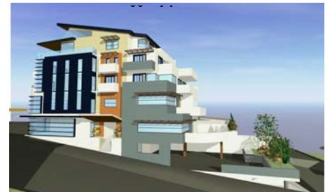
Mixed Use-Crown Street-Wollongong