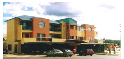
Mixed Use-Retail + Live Work -